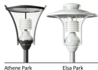
Athene Park Elsa Park